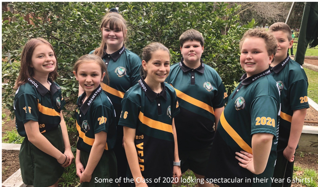
Some of the Class of 2020 looking spectacular in their Year 6 shirts!