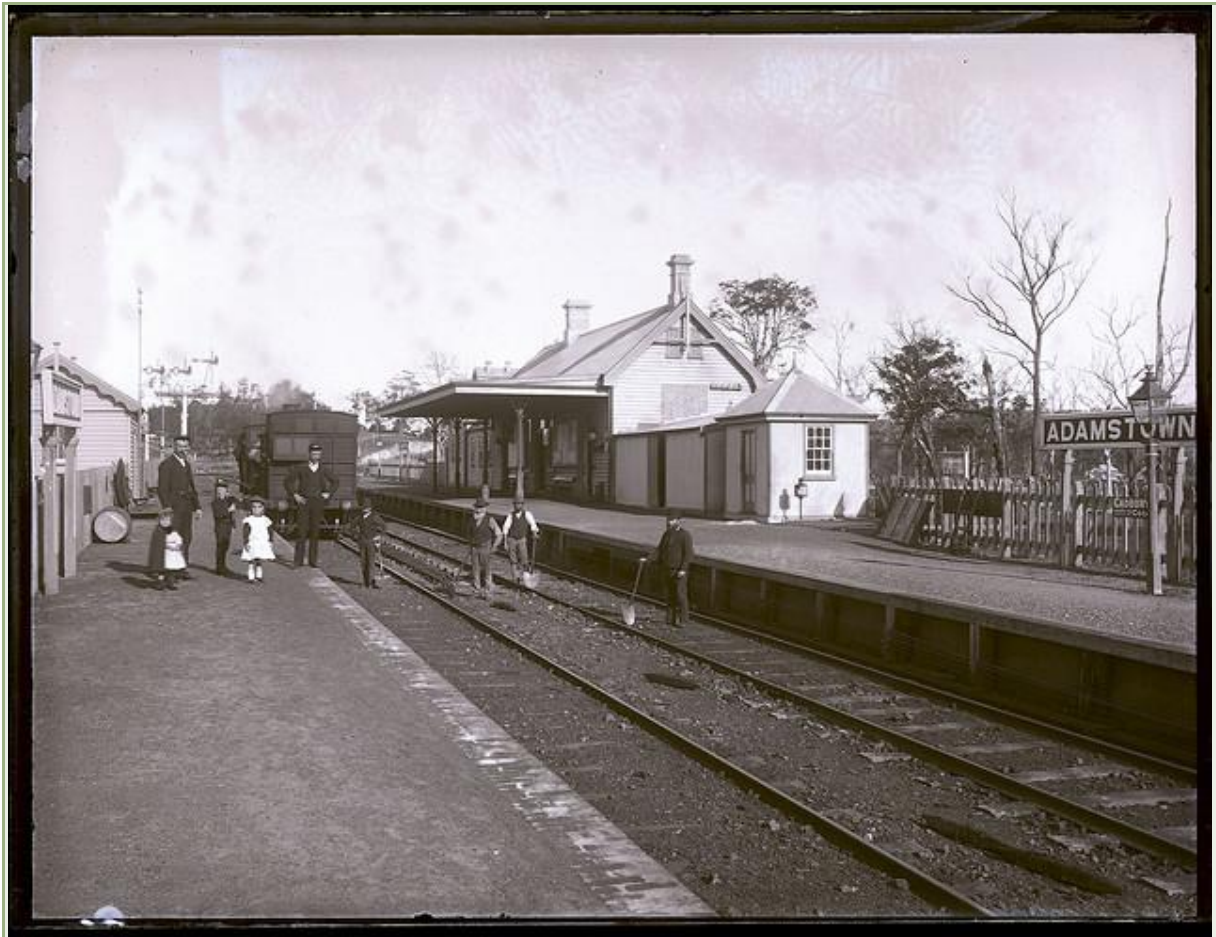
Adamstown Railway Station, Adamstown, NSW, c1898

http://www.newcastle.nsw.gov.au/about_newcastle/city_and_suburbs/suburbs/adamstown