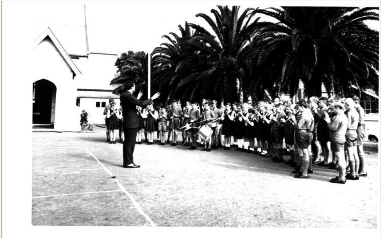
Band practice at Adamstown Public School 1960s

http://www.governmentschools.det.nsw.edu.au/photogallery/album14/ph_govt_schools_mu14_text.htm