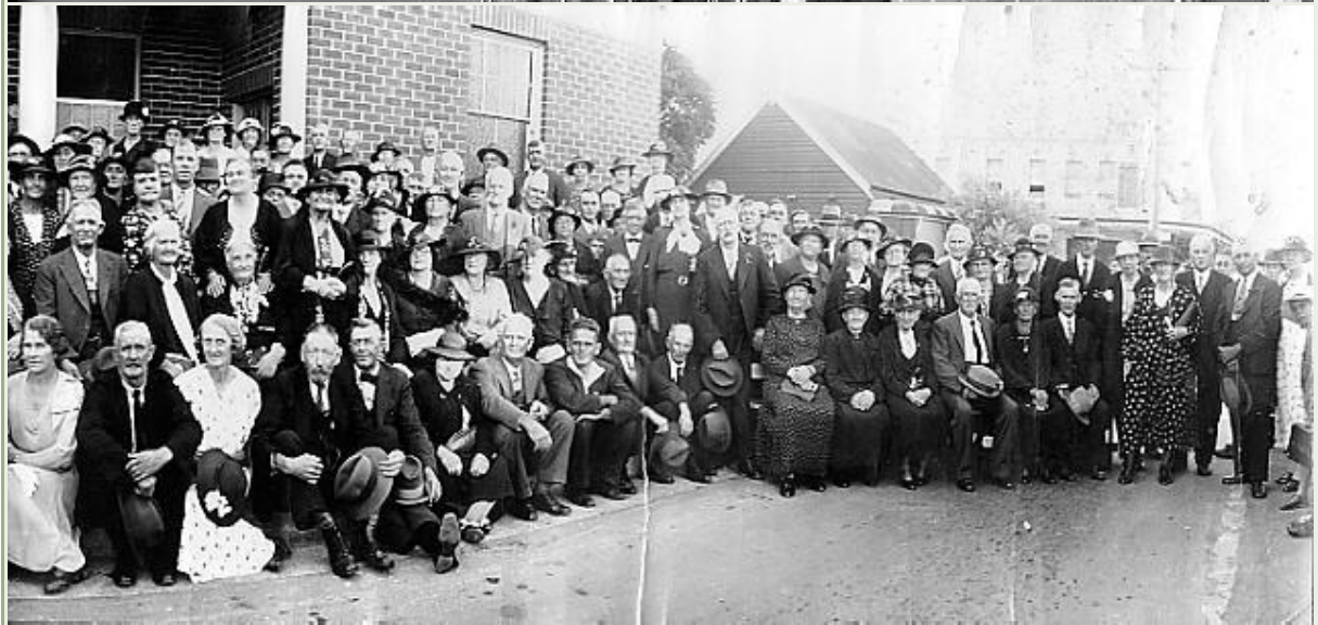
Adamstown Public School Jubilee Celebrations 1933

http://collections.ncc.nsw.gov.au/keemu/pages/nrm/Display.php?irn=35023&QueryPage=%2Fkeemu%2Fpages%2Fnrm%2Findex.htm