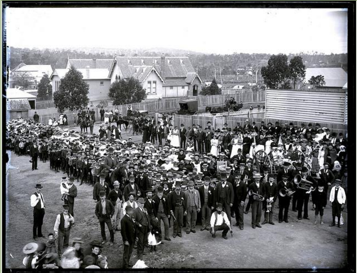
Adamstown School procession, Adamstown, NSW, 19 June 1897 Image shows a large group of students, and adults standing near the Adamstown School. A band can be seen in the bottom right of the image.