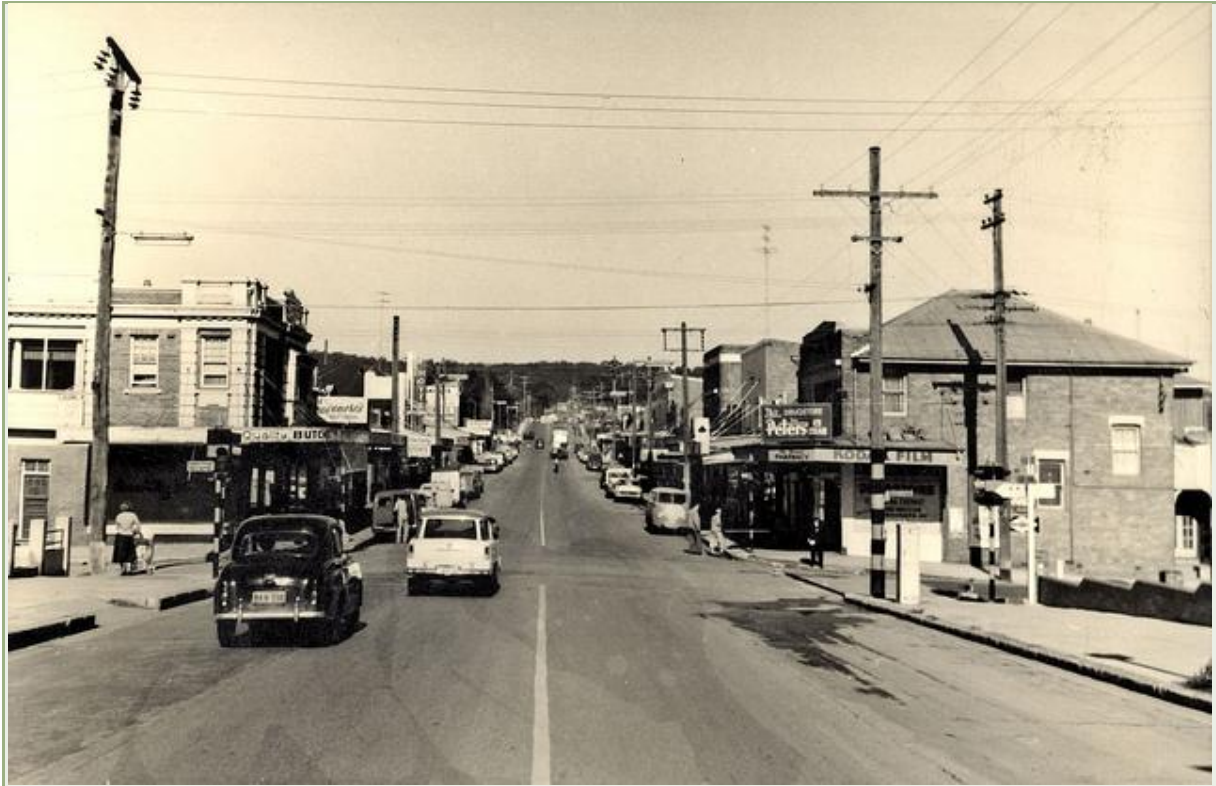
Adamstown Shopping Centre, NSW, Australia [c.1960's]

Cultural Collections at the University of Newcastle, NSW, Australia. http://www.flickr.com/photos/uon/5551744749/