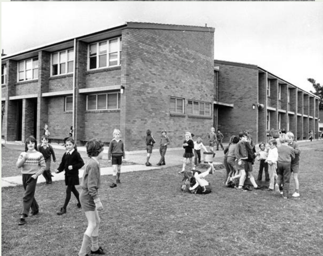
5 July 1977 Newcastle Morning Herald

http://collections.ncc.nsw.gov.au/keemu/objects/common/webmedia.php?irn=63260&reftable=ecatalogue&refirn=64258