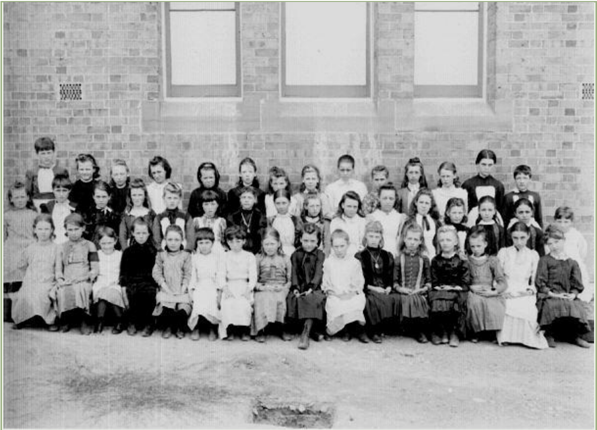
Group of Adamstown girl scholars 1891

http://collections.ncc.nsw.gov.au/keemu/pages/nrm/Display.php?irn=16120&QueryPage=%2Fkeemu%2Fpages%2Fnrm%2Findex.htm